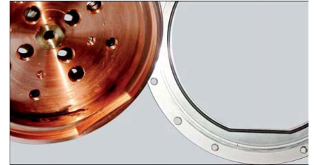
electrode and eroded piece

Apart from an increase in output, another advantage that soon paid off the product's higher purchase costs, were the extremely lower current costs. Two reasons which are already more than convincing. lonoplus ® , however, has even more to offer. Due to the special and